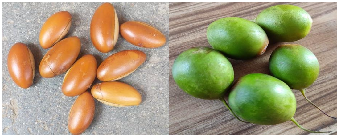
Figure 5. Diploknema butyracea (Roxb.) H.J.Lam. (Chiuri) seeds and fruits from Chitwan District Central Nepal.

Butter is extracted from the seed, and the extraction process by the traditional method is laborious and time-consuming (Figure 5). It takes whole days to peel 100 kg seed of Chiuri (Devkota et al., 2013). For the processing of the butter traditionally, first, the fruits are harvested and collected in a basket. Then fruits are squeezed, and pulp is removed. After the removal of pulp, the seed is dried for 2-3 days and crushed down into powdered form with the help of a traditional instrument called "Dhiki," and obtained powdered form is placed on a plate above a boiling pan and streamed for some time. Then the butter is extracted by using "Khole " or "Chepuwa." While doing this process, 25-30% of the butter from the seed is obtained. In Modern techniques, seeds are dry in a fry fan and expel in expeller. This technique (40-45%) of butter is extracted from the seed (Singh et al., 2010). The oil thus obtained should be refined, unrefined Chiuri has a creamy, pale yellowish color, but a fully refined butter is pure white. Typically 18 kg of seeds are required to produce a liter of ghee, and one household generally consumes about 2-5 kg of ghee per year.