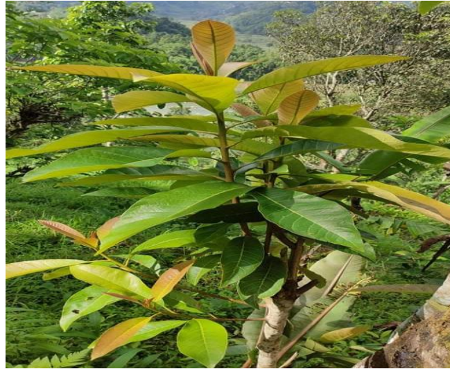
Figure 1. Diploknema butyracea (Roxb.) H.J.Lam. (Chiuri) from Syangja District, Western Nepal.

3 cm thick, dark grey in color, and light in weight. It gives a milky white fluid when cut freshly. Flowers are long, creamy white, axillary, clustered solitary, and ranges from 50 to 72 per fascicles. Light green fruits are seen in the early stage and appear yellowish or orange color when fully ripe. One fruit usually contains 1-2 seeds, and fruits look berry or pear-shaped. The wasteland, pastures, and inferior, rocky ridges of soil facing southwest-facing slopes are found in the southwest-facing slopes (Lead, 2007). Its product is mainly ghee or butter, which is obtained from the seed kernel. Hence it is known as the "Butter tree of Nepal." The life cycle of the insects like shoot borer and bark beetles is completed in these plants and affects the plant causing various diseases and reducing photosynthesis and fruits production in plants which ultimately causes the necrosis of the plant. Bats help in pollination and collects nectar from the flower.